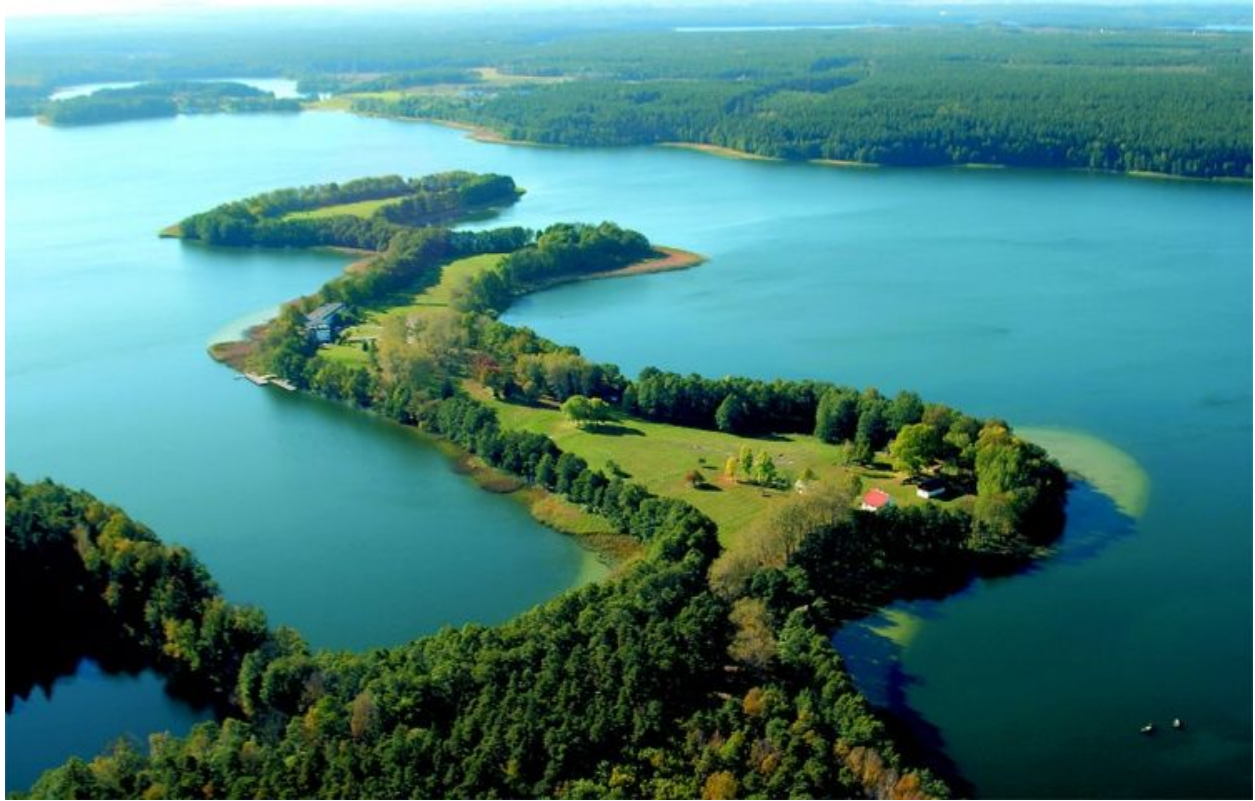
Mansurian Lakeland Beautiful lake district in Northeastern Poland