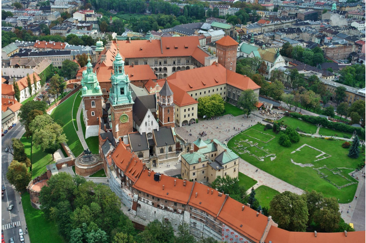
Wawel Castle Originally built in 11th century by Polish Monarchs