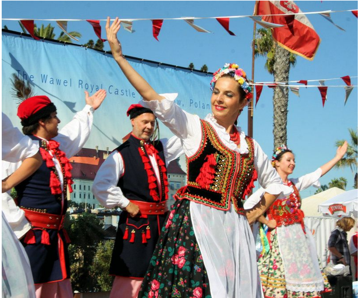
Traditional Polish Dress