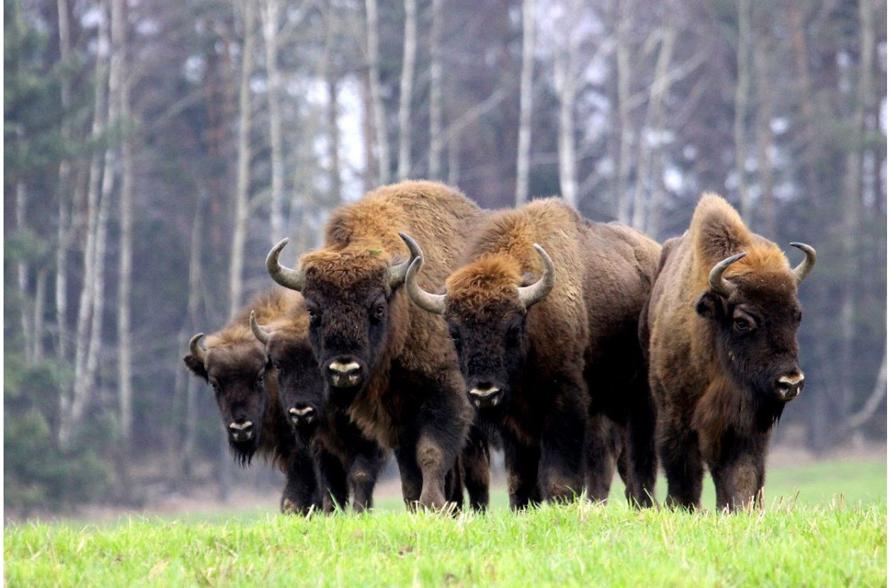
Bialowieza Forest Home to the largest population of European bison.