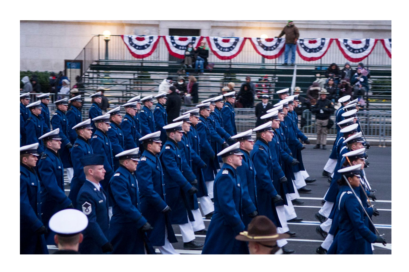
Academy Cadets during Inauguration Parade